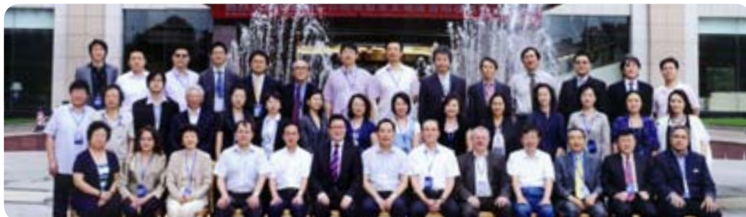
Group photo of the delegates of the Summit

For more information on IFCM, please visit www.ifcm.net