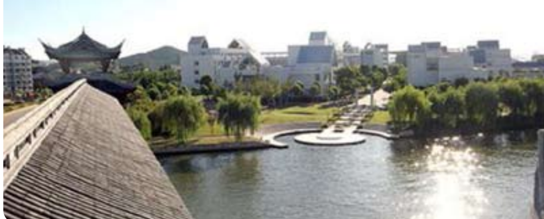
Shao Xing, China